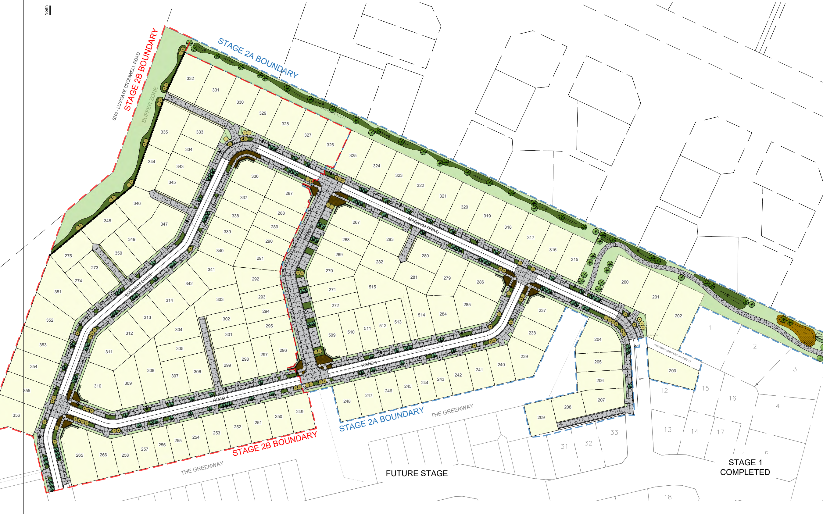
1 STAGE 2 SITE PLAN Scale: 1:750 at A1 / 1:1500 at A3

DO NOT SCALE DRAWING CONTRACTOR TO VERIFY ALL DIMENSIONS PRIOR TO COMMENCING ANY WORK. CAD FILE AVAILABLE FOR SETOUT ON REQUEST. © BAXTER DESIGN